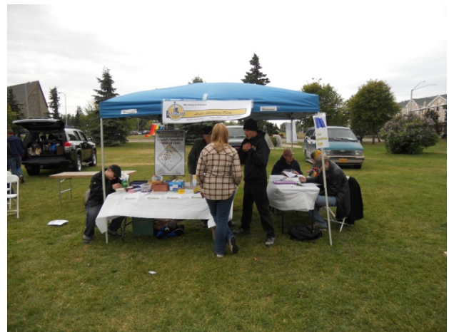
The Busy OPH Booth at Pridefest: Libertarians were the only political party to support the LGBT community